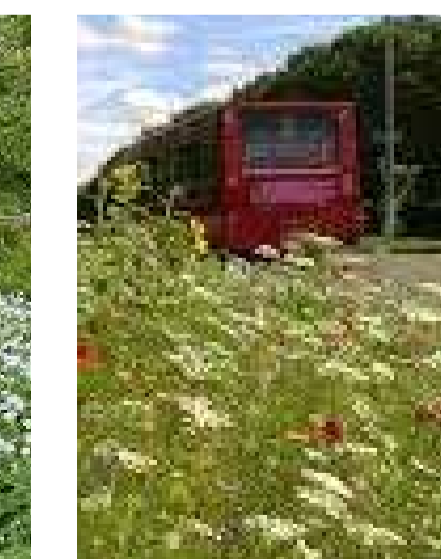
Wildflower & Bulbs