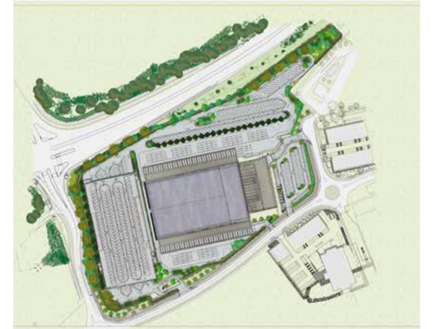
Phase 3 Years 15+