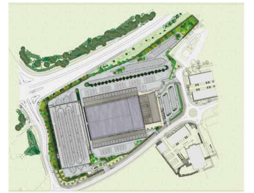
Phase 2 Years 5 to 10

Group of medium sized broad leaf trees planted with amenity grassland