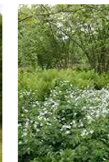
Native ground cover